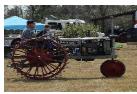
Fun for Everyone!!