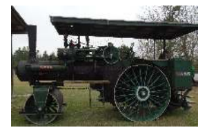
See Ya There!!